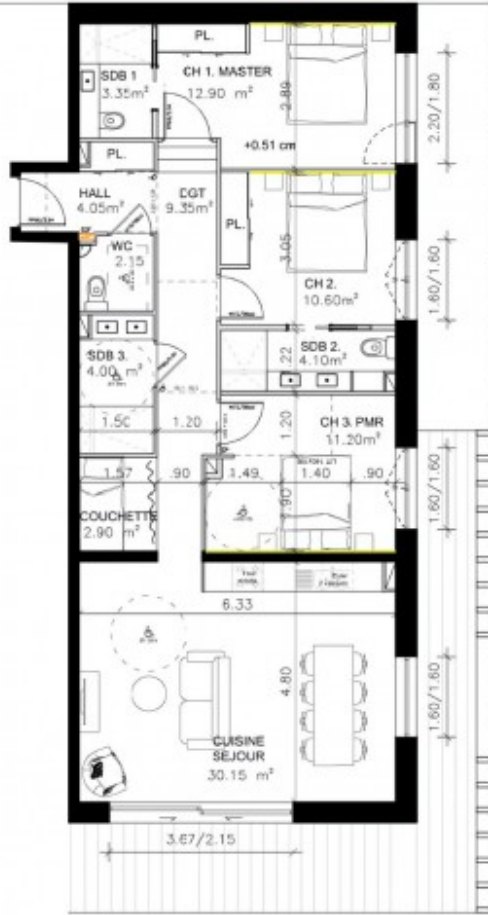
PLAN T4 BIS

NOTA : les surfaces de plus sont comprises dans les surfaces de plan.