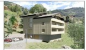
LES BALCONS DE LA BECHIGNE