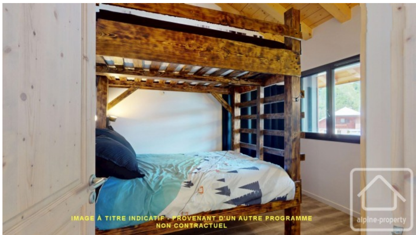
IMAGE À TITRE INDICATIF - PROVENANT D'UN AUTRE PROGRAMME NON CONTRACTUEL