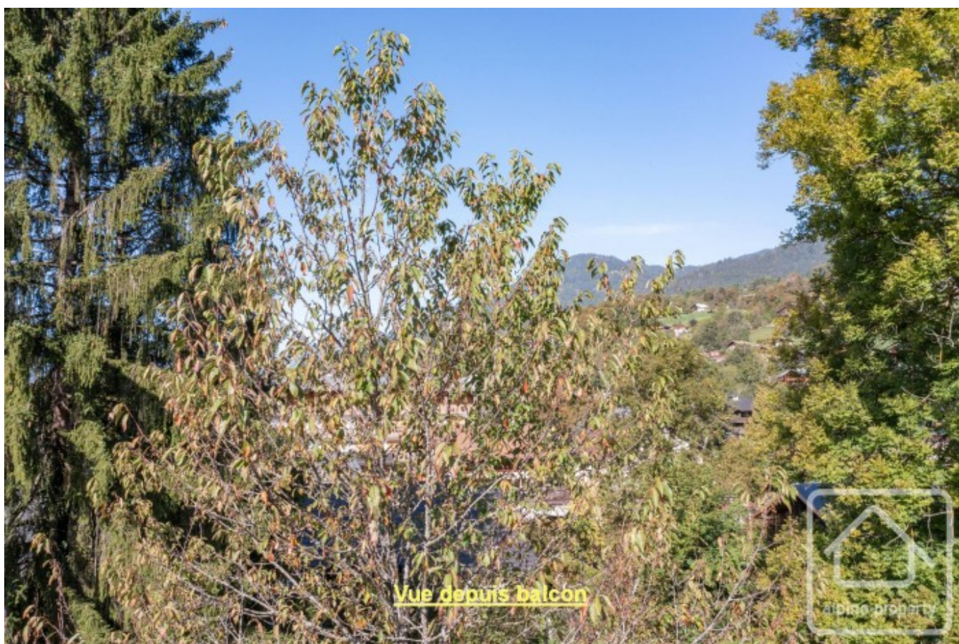
Vue depuis balcon