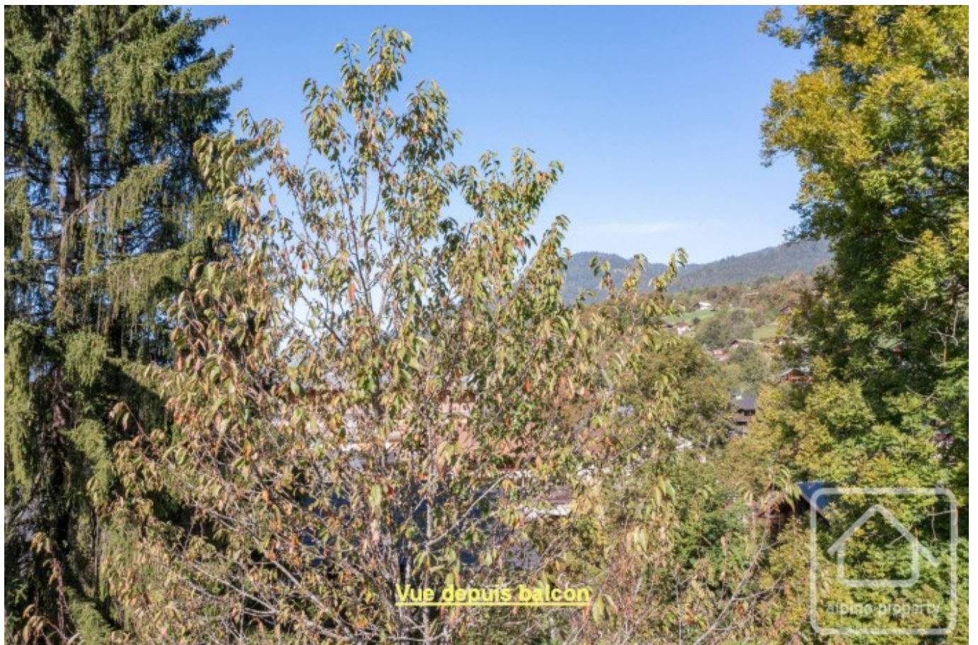
Vue depuis balcon