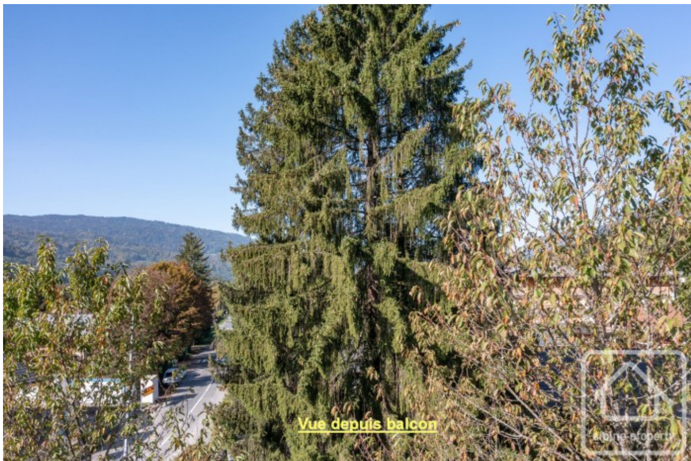
Vue depuis balcon