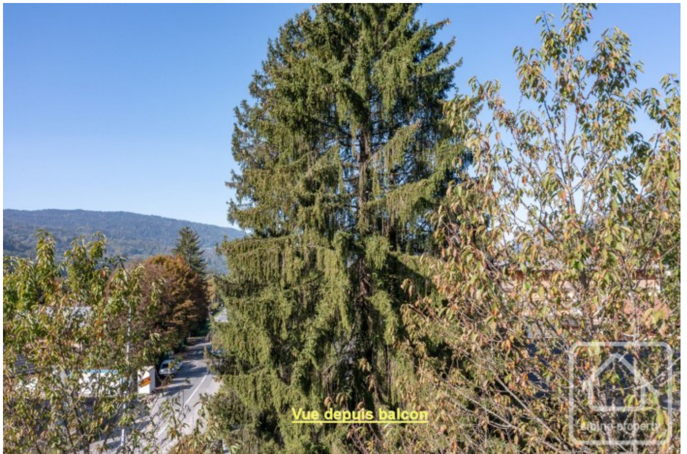
Vue depuis balcon