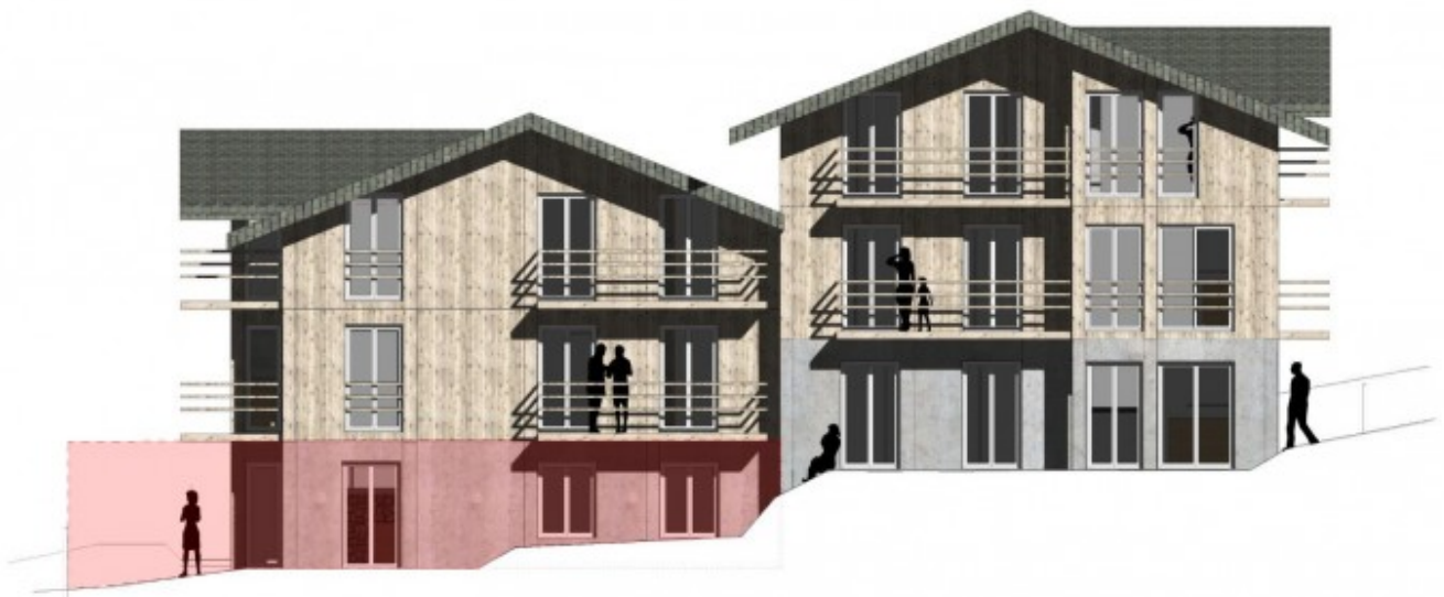
APPARTEMENT 1 REZ DE JARDIN EST - FAÇADE NORD