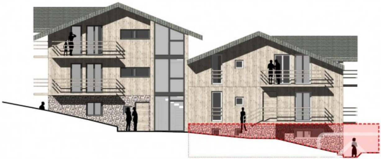
APPARTEMENT 1 REZ DE JARDIN EST - FAÇADE SUD