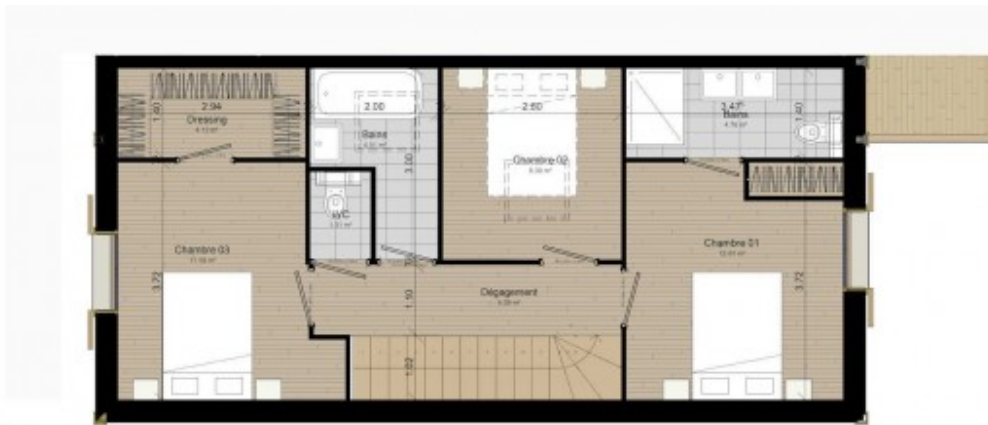
2 R+1 -