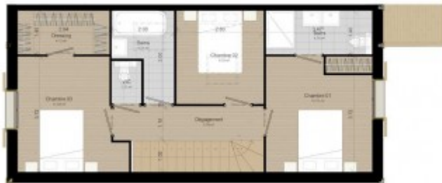
2 R+1 - C03