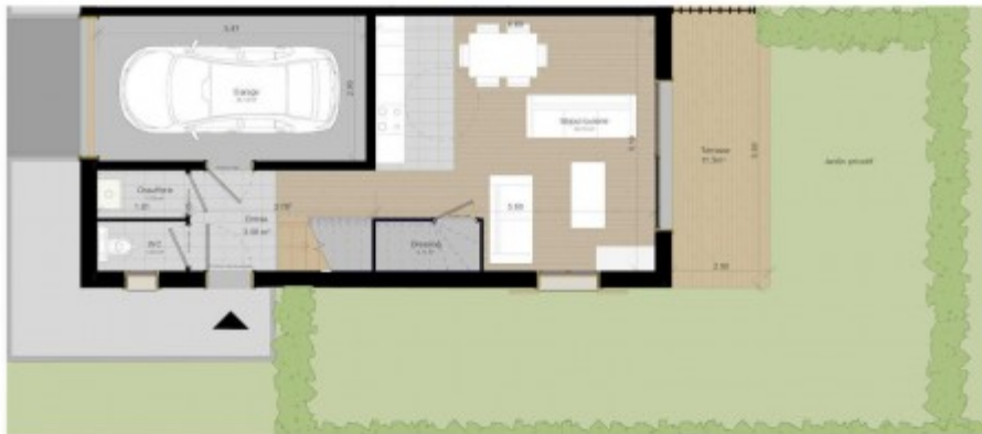
1 RDC - C03