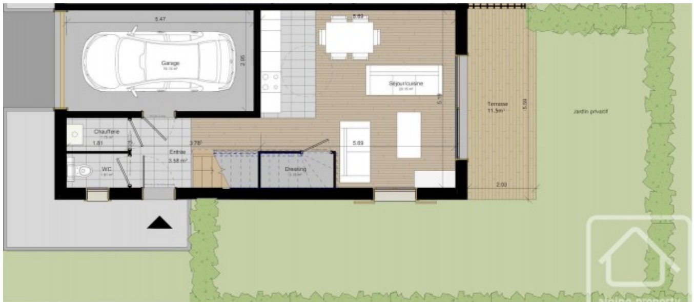
1 RDC - C03