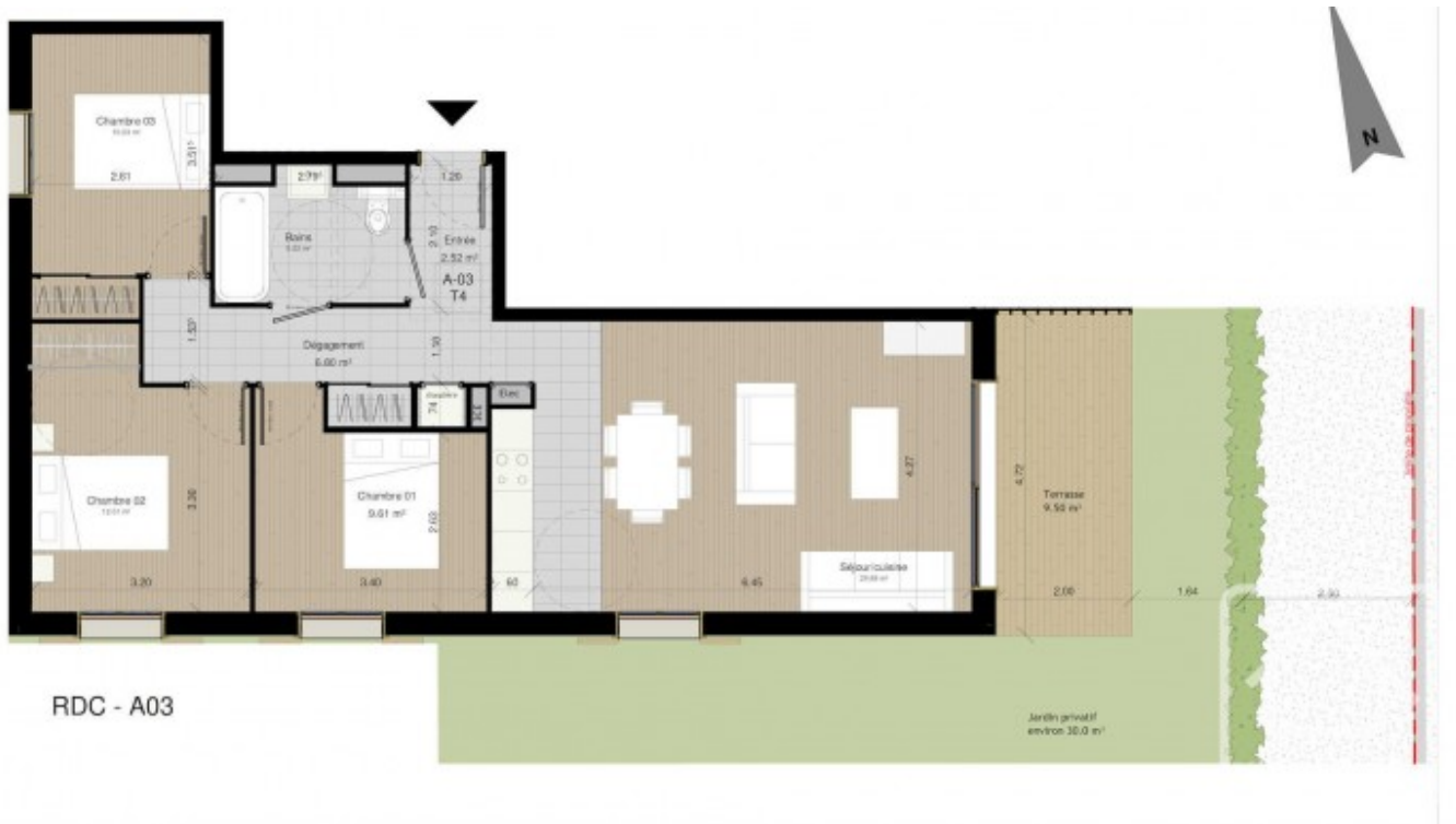
RDC - A03