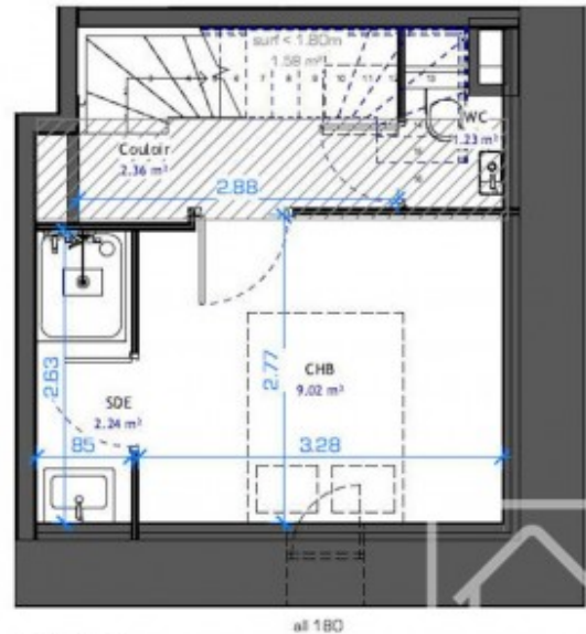
Lot 6 : R-1