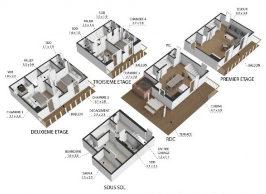
Toutes les dimensions indiquées sont approximatives. The plans shown are approximate and for information purposes only.