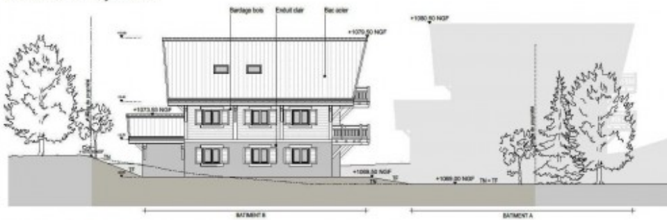
BATIMENT B - Façade Ouest