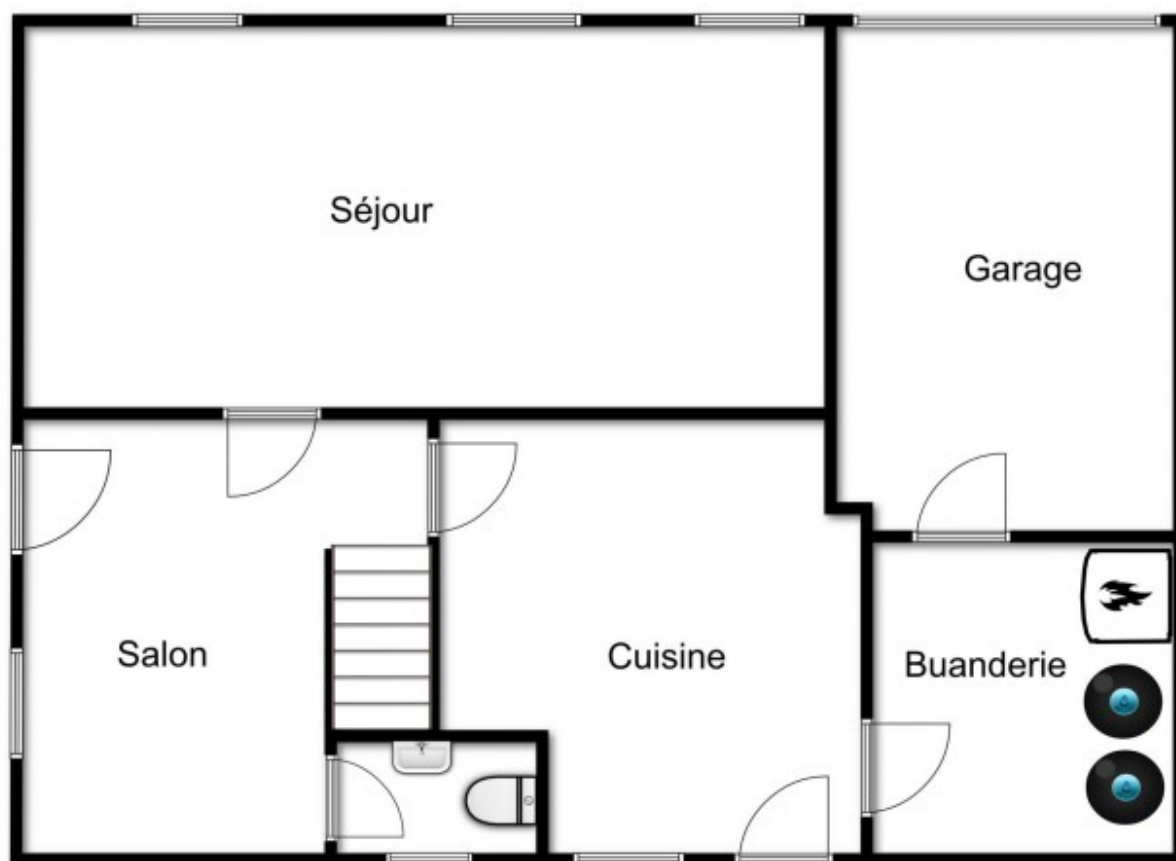
Rez de chaussée

The large living area has windows into the apex, feature beams, wiring for wall hung TV. Door off into a large bedroom, with open shower en-suite built around original beams.