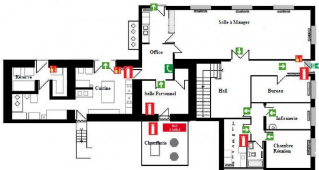
REZ DE CHAUSSEE