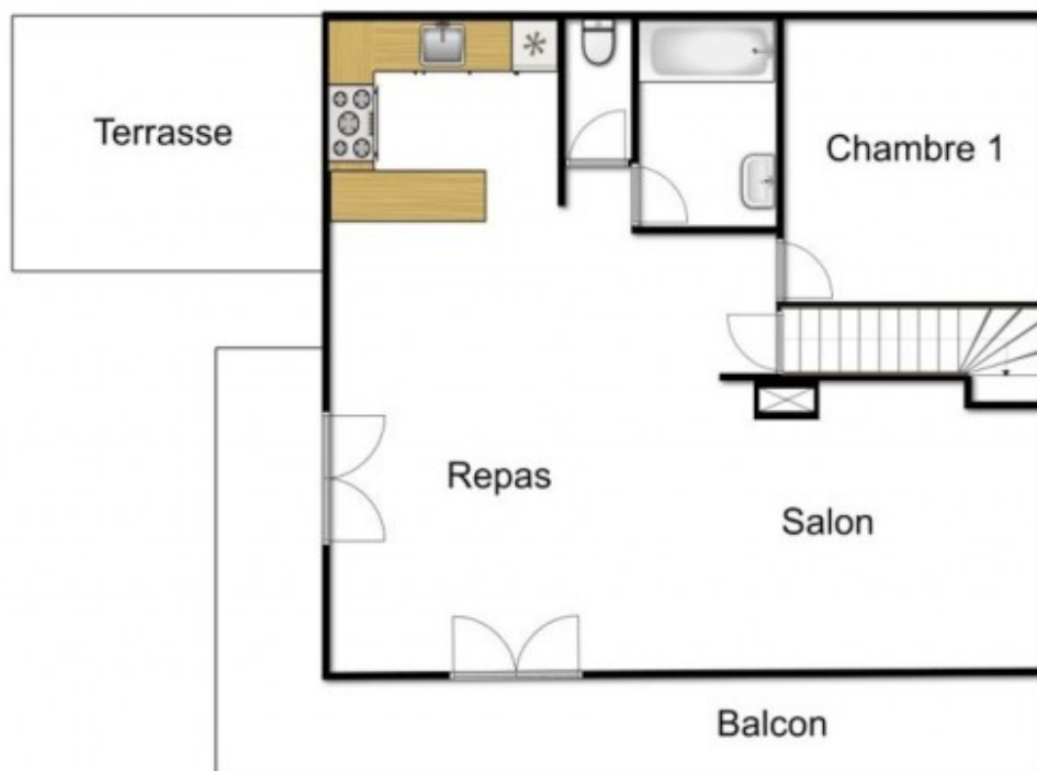
Rez de chaussée