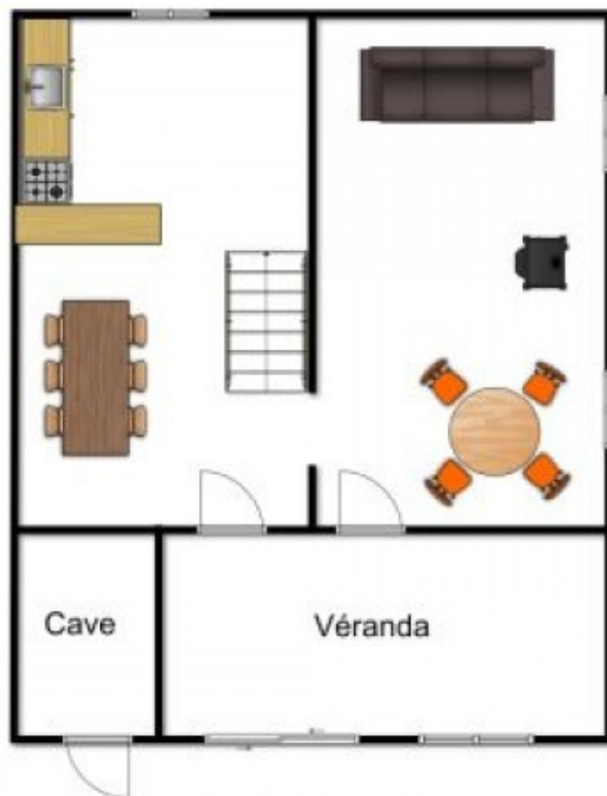
Rez de chaussée