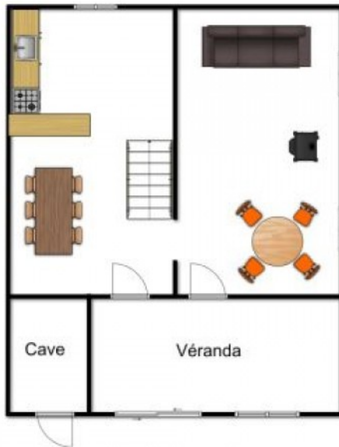
Rez de chaussée