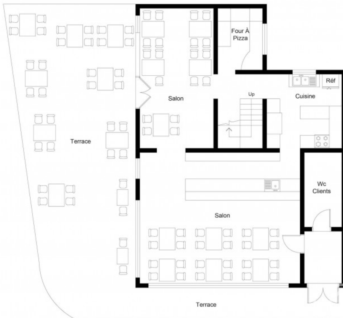
PLAN DU REZ-DE-CHAUSSÉE